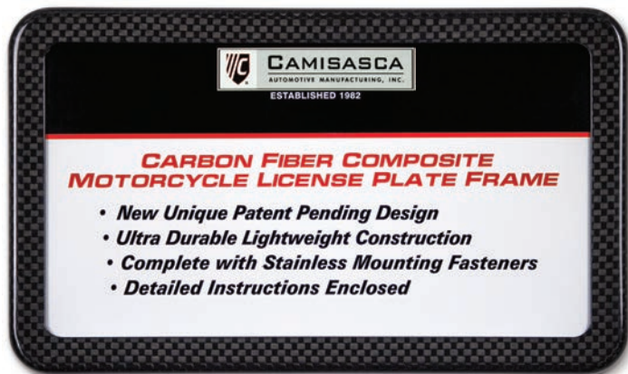
Plain Slimline Style